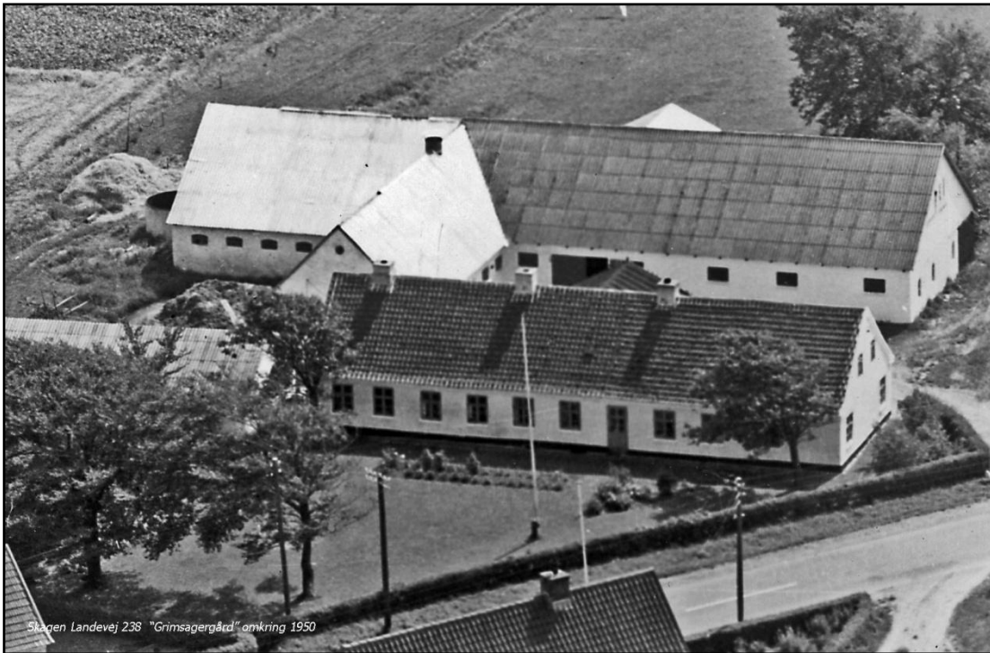
Stigen Landevej 238 "Grimsgærgård" omkring 1950