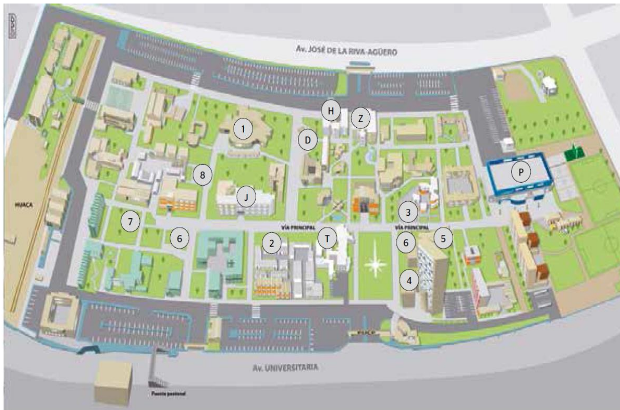
MAP 2 (Verificar si este mapa corresponde)